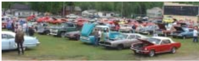
Sir Henry Wellcome Car Shows