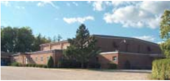
Wellcome Memorial Community Room