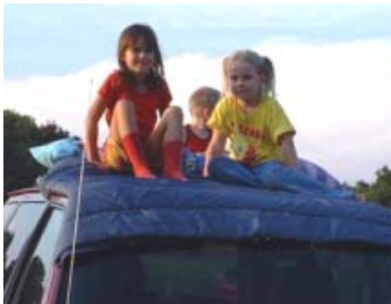
Everyone has their own way of watching the movies! www.hickorytech.net/~rbrandts