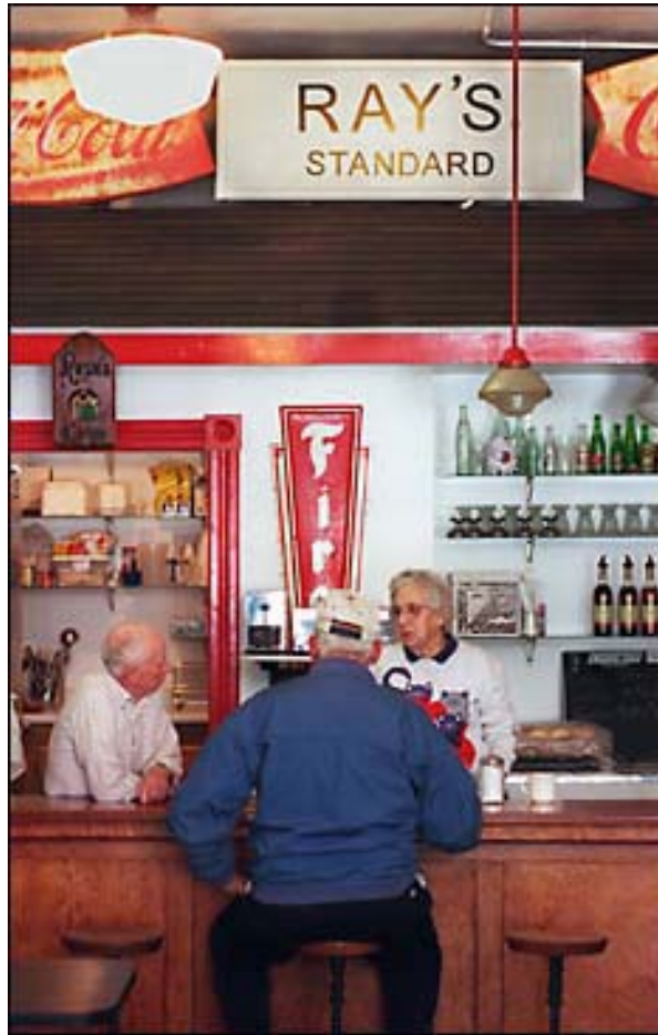
Formerly Crane's Coffee Shop