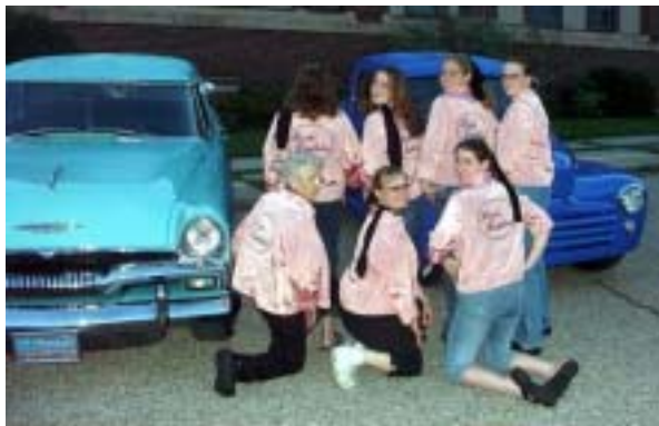
American Graffiti and GREASE movies