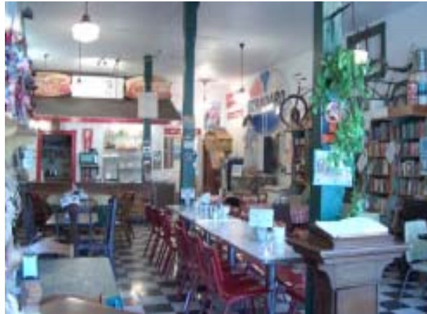
Inside Memorabilia of our fine City