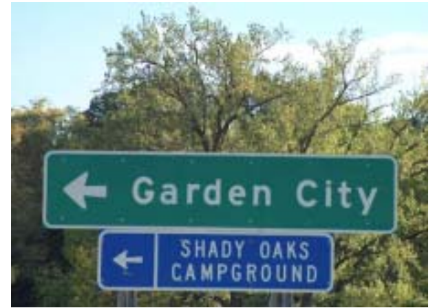
Welcome to our fine city!