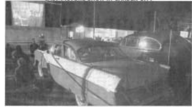
Brandts showed up to stare at the side of formerly Shree's coffee shop in Garden City, where story-corer Russ Brandts was showing "Thunder Road" free to the public. Brandts has shown old movie outdoors in Garden City for three years. It was the last showing of the summer.