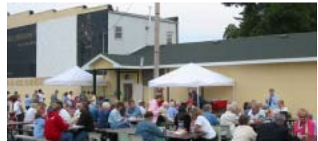
Free Bingo while waiting for dusk!